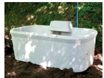
Water supplied to a storage tank at the highest point of the farm is gravity fed to the farm house and water troughs for livestock.