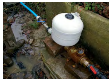
A single Papa Pump has lifted 6,000 litres of water per day up 50 metres to a storage tank. It has operated continuously for 9 years without requiring maintenance.