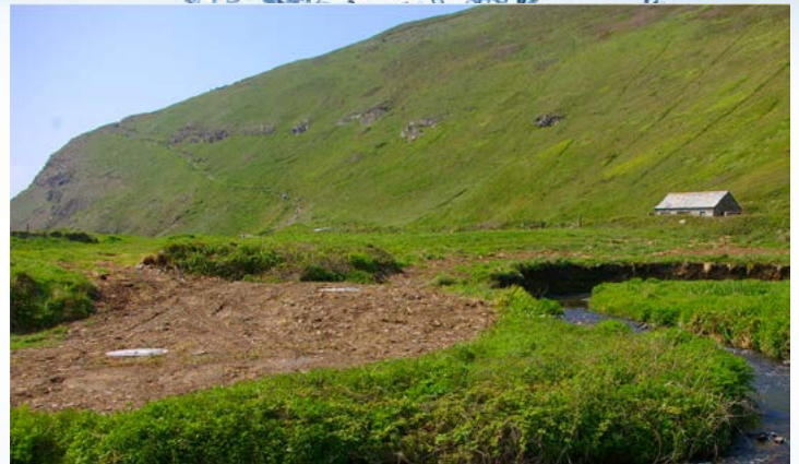
unobtrusive installation, silent operation