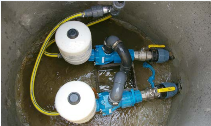
the dual Papa Pump installation

AN IDEAL SOLUTION FOR REMOTE PUBLIC SANITATION FACILITIES